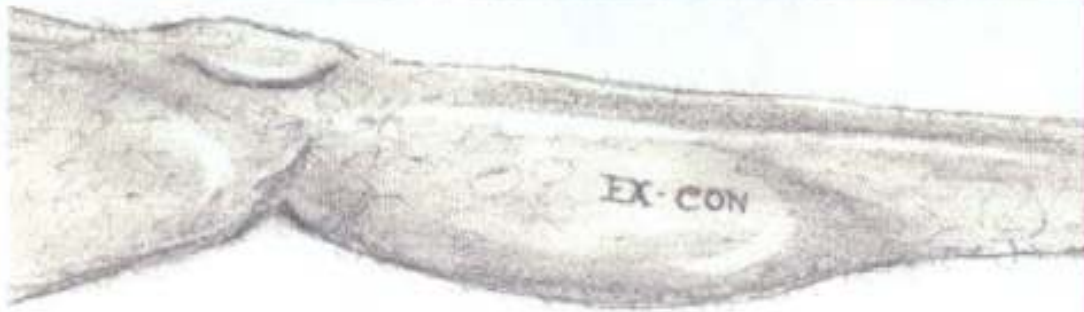
TATTOO INSIDE LEFT LEG NEAR CALF